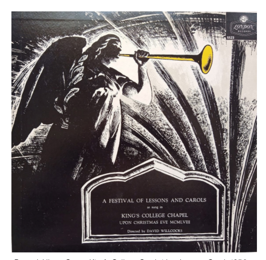
Record Album Cover, King's College Cambridge, Lessons Carols 1958.